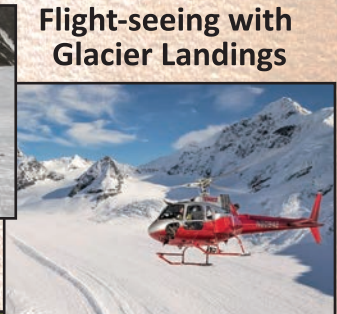
Flight-seeing with Glacier Landings